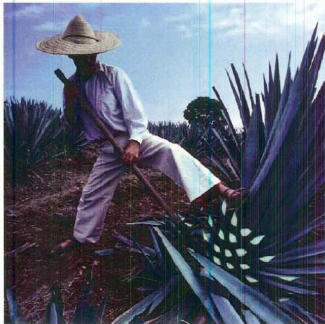
Jimador que Tequila